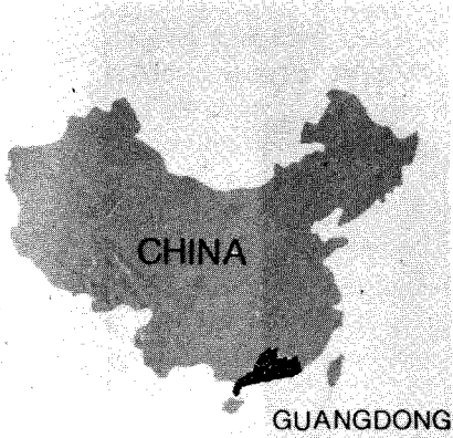
Location of Guangdong Province