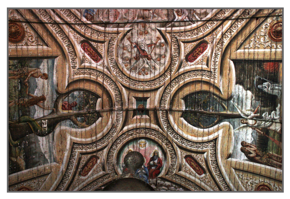
ILLUSTRATION 2: Second and third panels of the quadripartite section at San Miguel Arcangel depicting the Temptation of Eve (left side) with the Expulsion from Paradise (right side). Note the ogive arches that terminate each panel, forming radiating sword patterns for the frames.

the barrel vault together as its "borders." Within each section is a central panel at the apex of the nave, followed by two side panels on the slopes facing the north and south walls.<sup>8</sup> This section, however, is even more crudely painted compared with the lavish and carefully calibrated design of the transept and apse, leading us to affirm Savellon and Abaquita's (2004, 11) assertion that "...such defects are definitely not characteristic of Francia's work." Rather, a local informant provides a partial explanation.